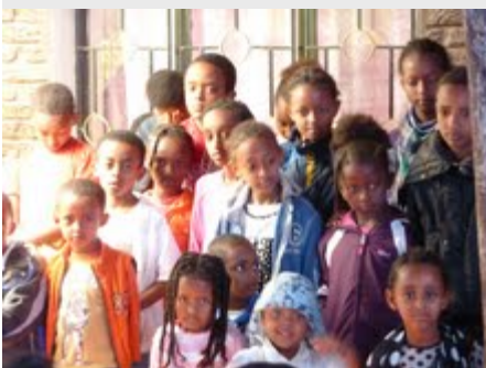
Children's Choir in Yerer