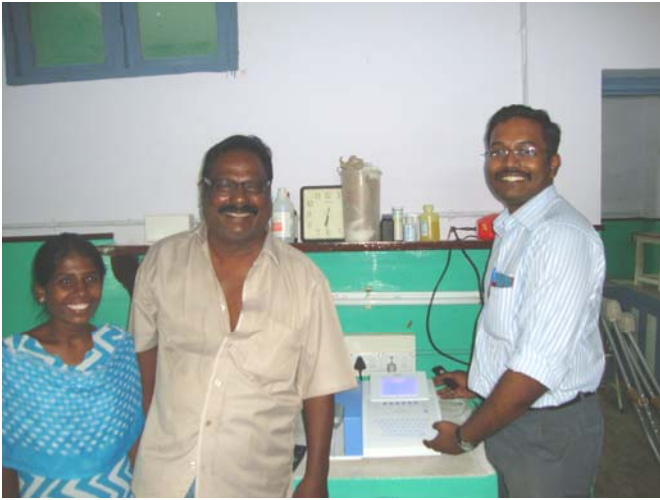
DMH medical staff with new blood analyzer.

While in India last August, a group of Bethlehem students visited The Danish Mission Hospital (DMH) in Tirukoilur, Tamil Nadu, in Southern India, a ministry project site through Lutheran Partners in Global Ministry. DMH provides high quality and affordable or free care to a large rural population,